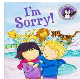
I'm Sorry (Book of Manners) by Parragon Books